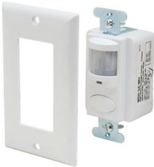
Lithonia Passive Infrared Switch Wall Occupancy Sensor White Manufacturer Number: 184LCT