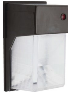
HD Supply / Photocell Wall Pack Wattage/Voltage: 27 watt - 120 Volt Finish: Bronze Polycarbonate Housing Frosted Prismatic Acrylic Lens Bulb Type: Integrated LED Kelvin: 4100 Dimensions: 10-3/4H x 6- 1/4W x 5-1/2"D Manufacturer Number: HDS 326111