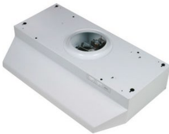
Broan 30" Vented Range Hood 7" Round Vent 190 CFM Manufacturer Number: 423001