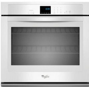
Whirlpool 27-inch width Single Wall Oven Manufacturer Number: WOS51EC7AW