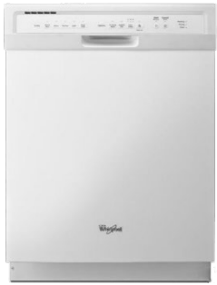
Whirlpool 24-inch Built-in Dishwasher Manufacturer Number: WDF550SAFW