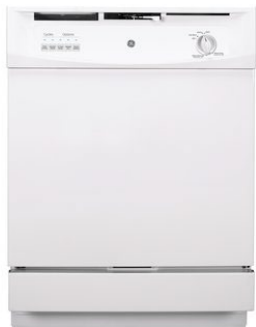
GE 24-inch Built-in Dishwasher Manufacturer Number: GSD3300DWW