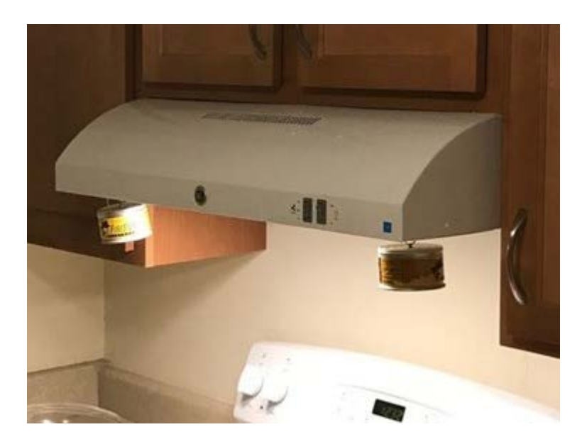
EXAMPLE OF NON-CONFORMING FIRE STOP INSTALLATION

Manufacturer Number: 677-1 (Black), 677-2 (White)