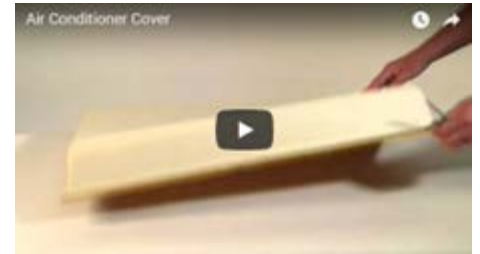
http://www.parksupplyofamerica.com Mid States Plastics Chill Stop'r Air Conditioner Cover

In locations with permanently installed window or through wall air conditioners, a plastic hard cover should be installed on the interior of the air conditioner unit during the winter months. Air conditioner covers reduce cold air infiltration into the units/building, save on heating costs, and make units more comfortable. For use on the interior of the unit only.